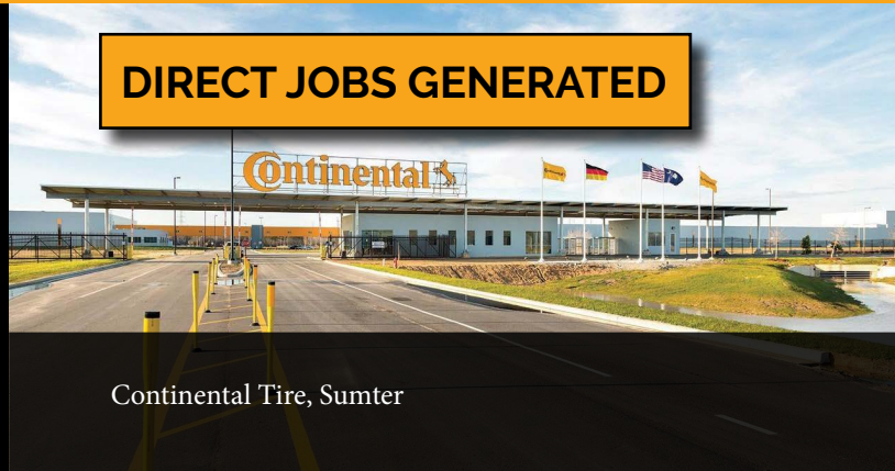
Continental Tire, Sumter