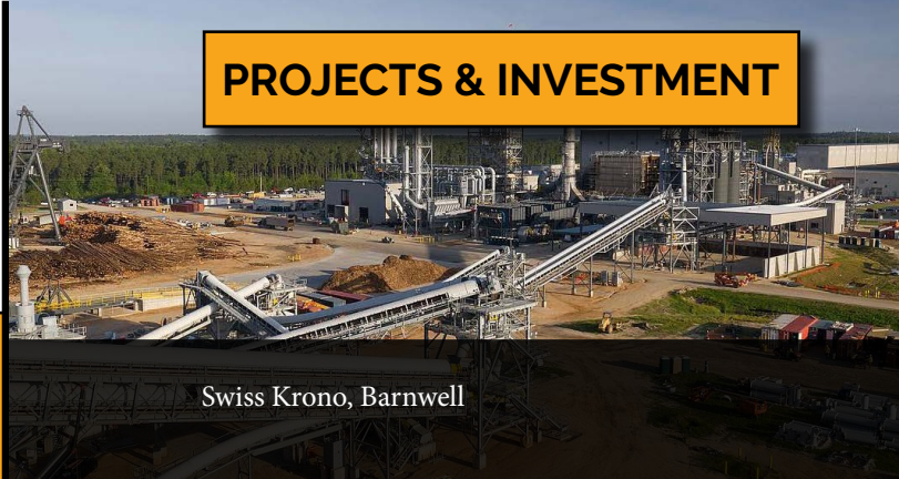
Swiss Krono, Barnwell