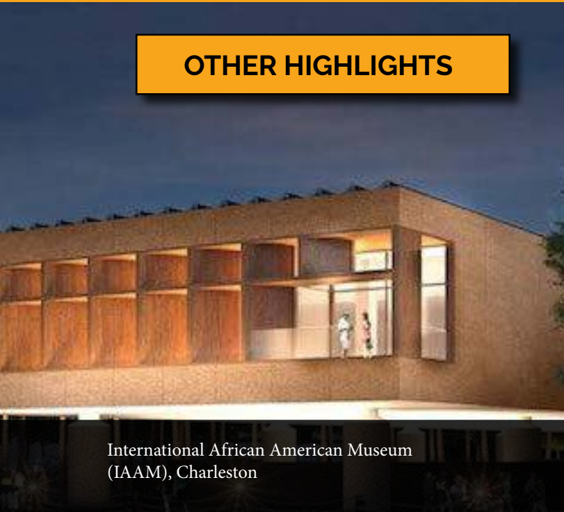
International African American Museum (IAAM), Charleston